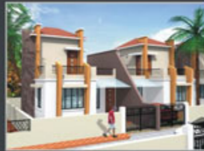
Twin Bungalow (B Type)