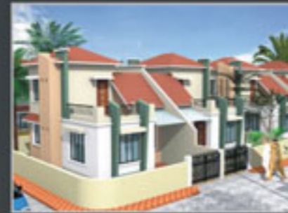
Twin Bungalow (D Type)