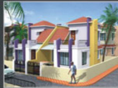
Twin Bungalow (C Type)