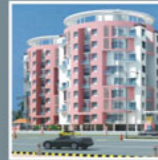
Le Regalia, Nashik

Mumbai office: 14, Nyaysagar, Near Chinai College, Old Nagardas Road, Andheri(E), Mumbai- 400069 | Contact: 022 61378500