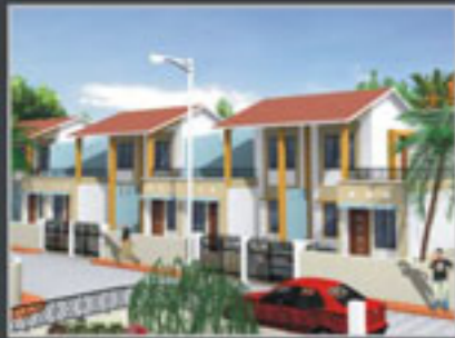
Row House (A Type)