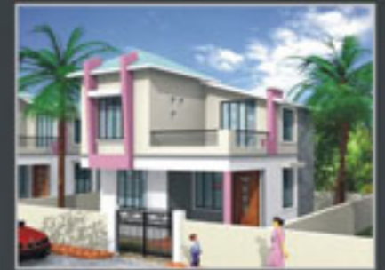
Individual Bungalow (E Type)